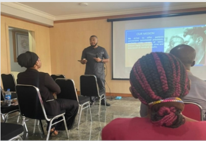
Chemhealth onboarding program Day - 1