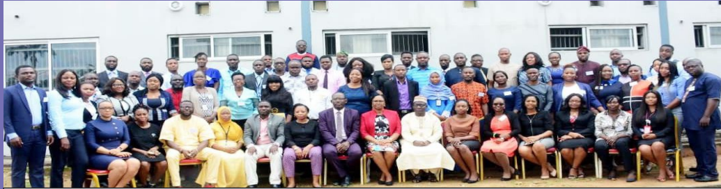
DEVELOPING SUPERVISORY SKILLS COURSE (FIRS LAGOS)