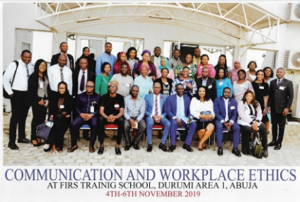
COMMUNICATION AND WORKPLACE ETHICS AT FIRS TRAINING SCHOOL, DURUMI AREA I, ABUJA 4TH-6TH NOVEMBER 2019