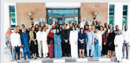
Communication & Workplace Ethics (Run One)

CBN International Training Institute, Abuja. Date: 8th - 11th May 2019