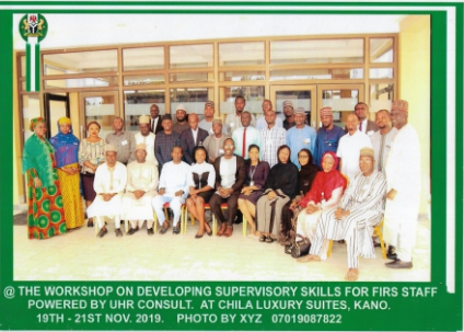
@ THE WORKSHOP ON DEVELOPING SUPERVISORY SKILLS FOR FIRS STAFF POWERED BY UHR CONSULT. AT CHILA LUXURY SUITES, KANO. 19TH - 21ST NOV. 2019.