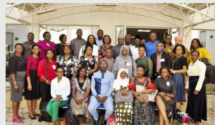
DEVELOPING SUPERVISORY SKILLS AT FIRS TRAINING SCHOOL, DURUMI AREA 1, ABUJA 4TH-6TH NOVEMBER 2019