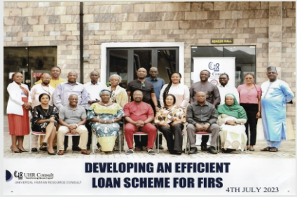
DEVELOPING AN EFFICIENT LOAN SCHEME FOR FIRS 4TH JULY 2023