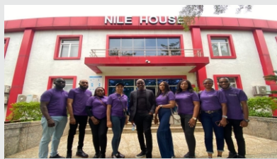
UHR CSR at Nile University