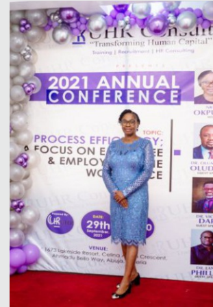
UHR Consult "Transforming Human Capital" Training | Recruitment | HR Consulting 2021 ANNUAL CONFERENCE TOPIC: PROCESS EFFICIENCY; FOCUS ON EMPLOYEE & EMPLOYER WORKFORCE DATE: 29th NOV 2021 VENUE: 16/7 Ekurinri Resort, Calabar